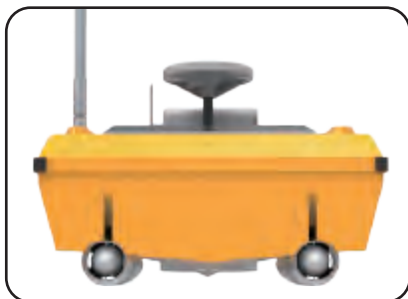
Top speed 5m/s. Rugged and robust design for thruster protection