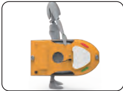
Compact and lightweight, one man hand carry, easy launch and retrieve