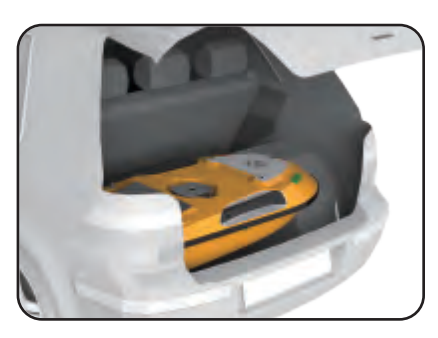
105cm length easy in field transportation