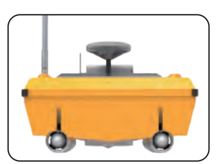
Top speed 5m/s. Rugged and robust design for thruster protection